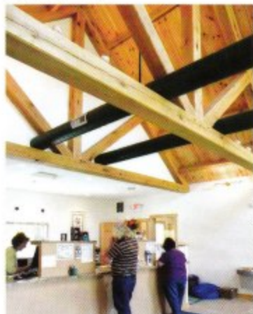
King post and strut trusses.

O akBridge Timber Framing in Howard builds handcrafted, sustainable timber frame structures using mortise and tenon joinery without any metal. Here is the 1,568-sf K & E Credit Union built in Mt. Vernon by Shrock Premier Custom Construction and designed by Ballard Architectural Studio. The project was panelized with SIPs, which allow for exceptional energy efficiency. BXM