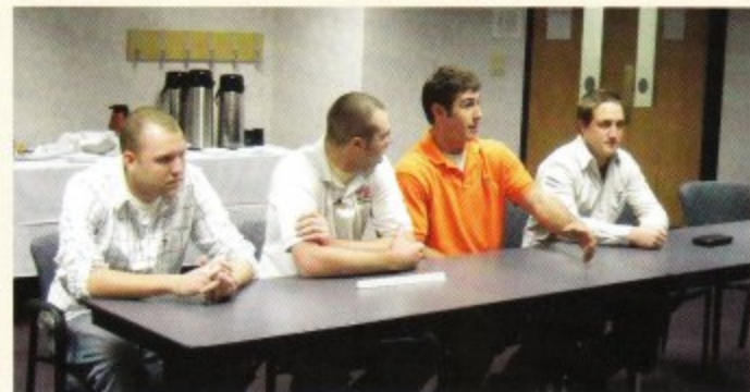
The Builders estimating competition winners.